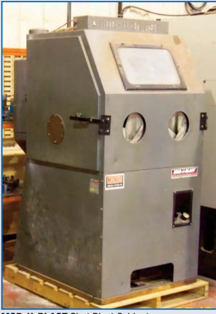
MOD-U-BLAST Shot Blast Cabinet