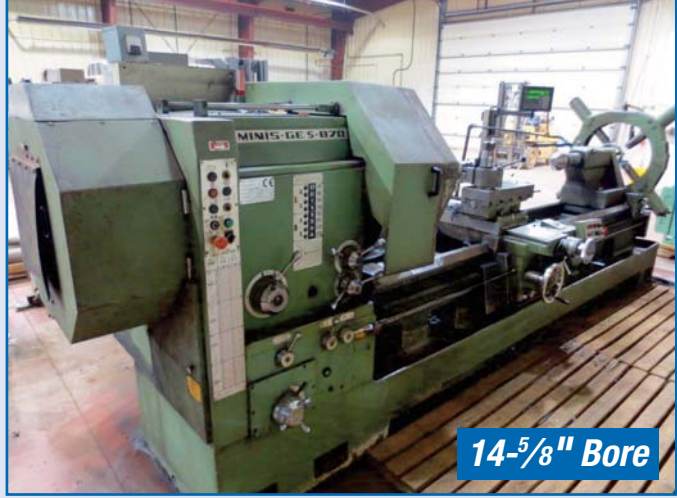
GEMINIS GE 5-870S Engine Lathe, 34" x 120'

1998 GEMINIS GE 5-870S Hollow Spindle Engine Lathe, 34" x 120", 14-5/8" Bore, 22.8" Swing Over Cross Slide, Dual 32" Chucks, Taper, Newall DRO, sn 5968 2004 KINGSTON HR-3000 Gap Bed Engine Lathe, 36" x 120", 20 ½" Swing Over Cross Slide, 4 1/16" Bore, 27 HP, Taper, sn 3M930216G