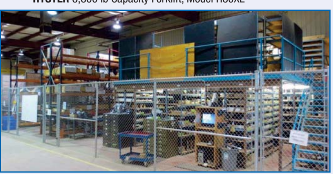
Mezzanine, Approx. 25'x15'