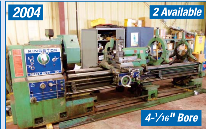
KINGSTON HR-3000 Lathe, 36" x 120"