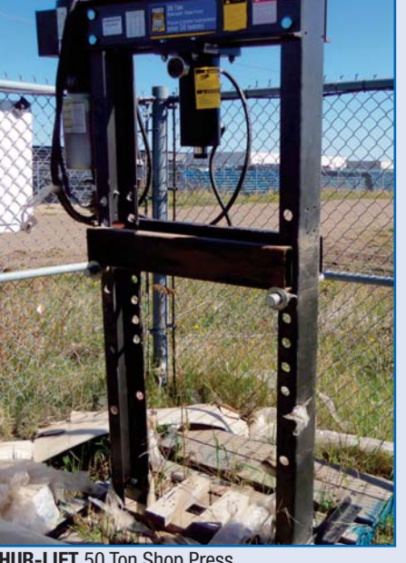
SHUR-LIFT 50 Ton Shop Press