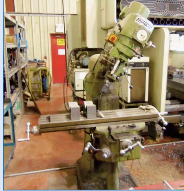
FORWARD Vertical Mill, Model 942