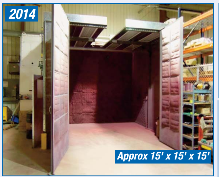
MERCURY Model M1VTC122 Paint Booth