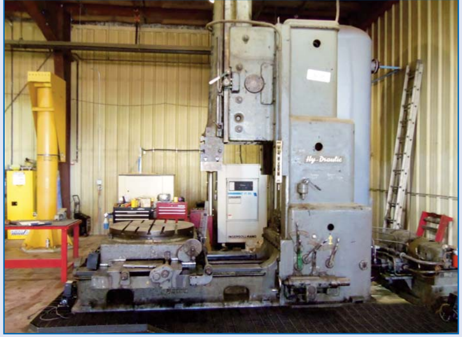
ROCKFORD Hy-Draulic 42" Vertical Slotter