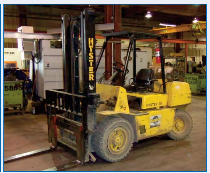
HYSTER 8,800 lb Capacity Forklift, Model H80XL