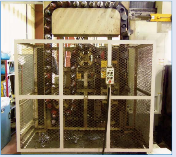
NOMURA FBA-70T CNC Table-Type Horizontal Boring Mill, 4.3" Spindle, Fanuc 16M Control, Travels: X-78", Y-51", Z-34", W-15.8", Rotary Table Size 55.5" x 63", Facing Head, 60 ATC